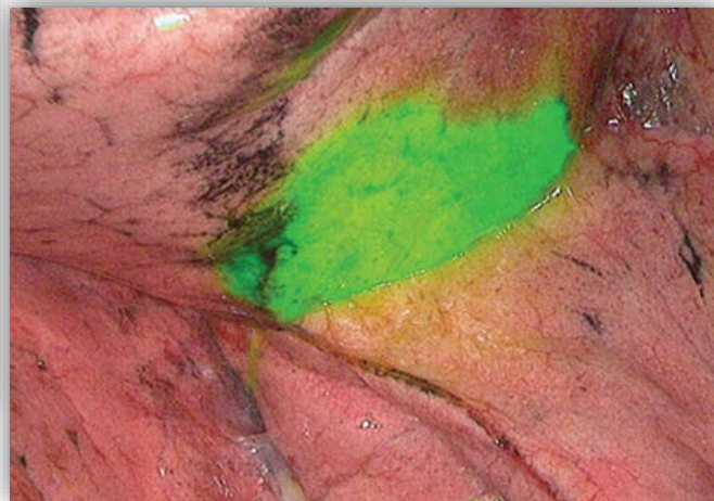
Small nodule localization